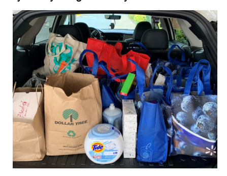
One load delivered!

Cherry Park Elementary School is having a Suds and Duds event that the Sunnyside Church is invited to participate in. We are looking for new shoes for girls and boys, kids sizes 8-12 and adult sizes 4-8. They are also needing "suds," which would be soap, shampoo, conditioner, laundry soap, dish soap, and dish washer liquid. We will have receptacles in the church lobby to receive donations. Thank you in advance for blessing the families in our community with your generosity.