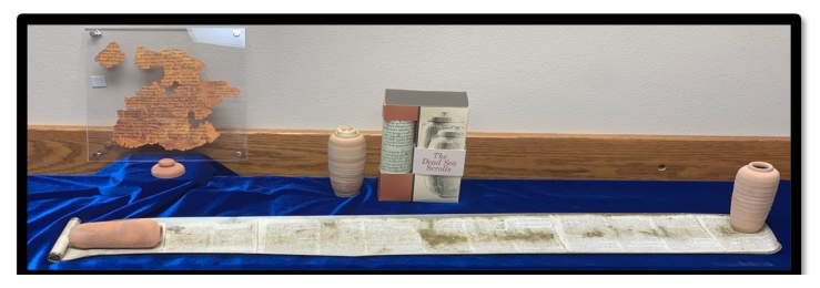
Lifesize replica of a part of Isaiah scroll, and miniature replica Isaiah scroll and clay jars that housed them.

What is the big deal about the Dead Sea Scrolls?