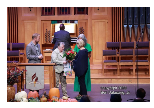
WWU Bread Night