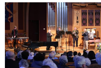
Advent Trombone Quartet