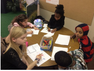
Primary Sabbath School