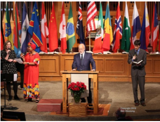
Worship Music Team