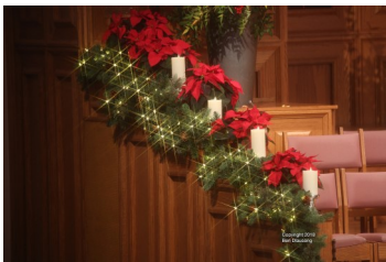
Christmas at Sunnyside