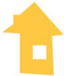
YOU ARE HERE